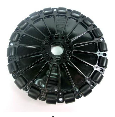
Step 6: Insert a M3 nylock nut and screw it in with its M3 x 10mm SHCS until all holes have been filled.

*Note: You might need an extra hand to help you firmly hold down the middle part of the omni web.