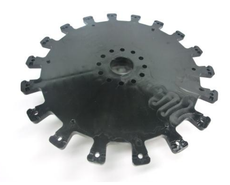
Step 4: Place the second 8" plastic omni web on top of the first web, making sure that the one pin goes into its designated hole.