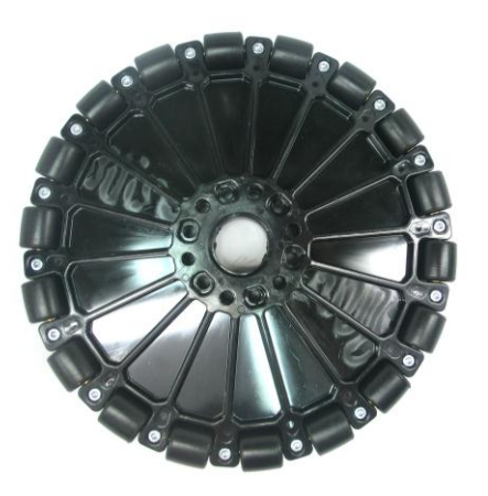
Step 7: Flip over the omni wheel so the ends of the screws are shown. Place a M5 nylock nut into one of the 6 middle spots. Hold on to that nut with your finger. Insert the corresponding M5 x 0.8 x 20mm SHCS, and tighten it in.