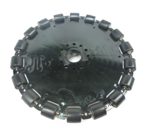
<u>Step 3:</u> Place the black SBR rollers into their appropriate slots.