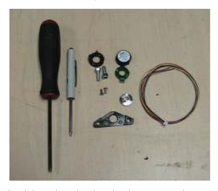
Step 1: Attach encoder circuit board to circular plastic mount, using small screws to thread into encoder mount pad.

Tools needed: 5/32" hex wrench, small Phillips screwdriver