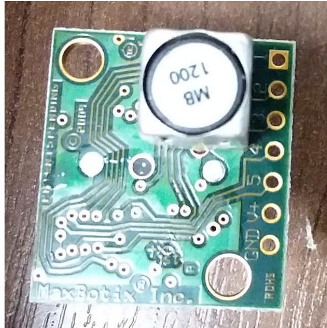
Back (no wiring) Note: square hole for reference